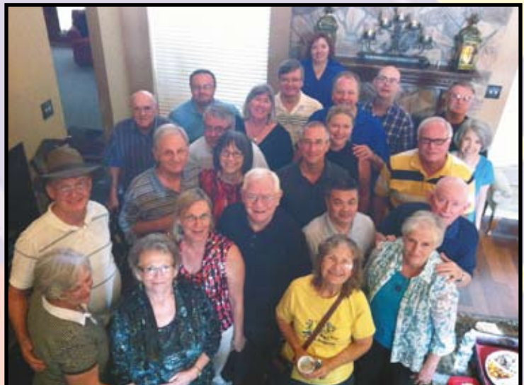
North Texas Society