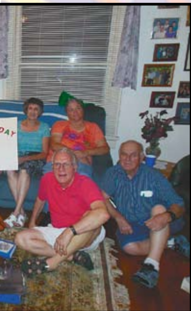
Pueblo, CO Urantia Book Study Group