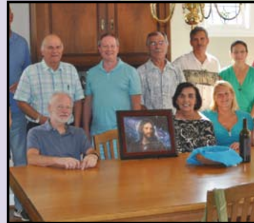
Mid-Peninsula Study Group of the San Franc