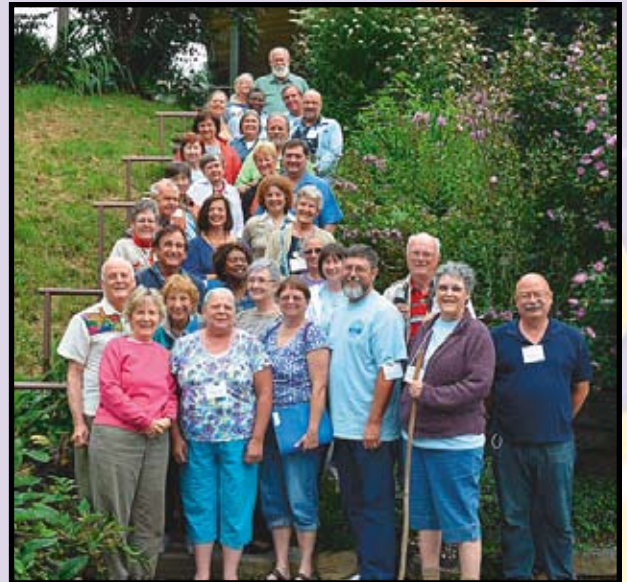
Heart of Mountains Retreat in North Carolina