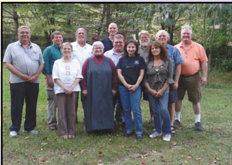
Orvonton Society Bloomington, IN