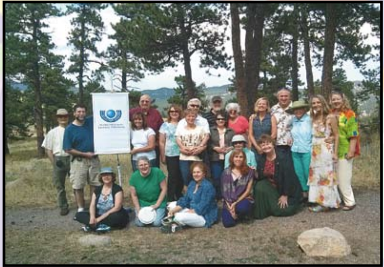
Rocky Mountain Spiritual Fellowship

...ess so that neither of them slept ...angs of childbirth were well in ...1, 7 B.C., with the help and kind ...avelers, Mary was delivered of a ...s born into the world, was wrapped ...ought along for such a possible ...y manger.” [122:8.1] (P. 1351)