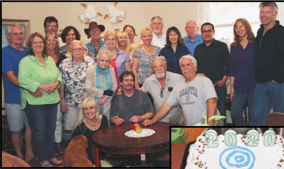
Grand Canyon Society