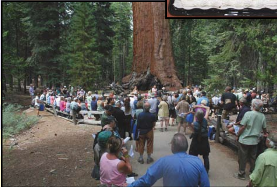
The United Urantia Family Festival gathering, Yosemite