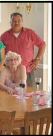
San Francisco Bay Area